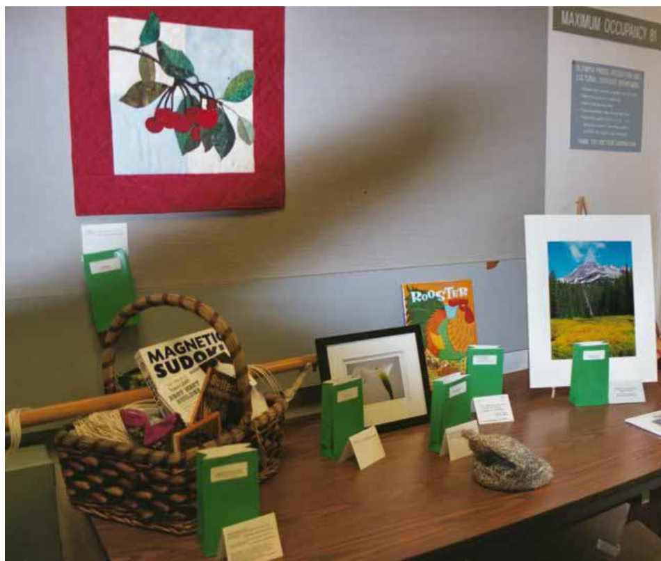
A few of the items in the raffle held at the 10th Anniversary meeting. Proceeds will support the chapter's Publisher Outreach Program.