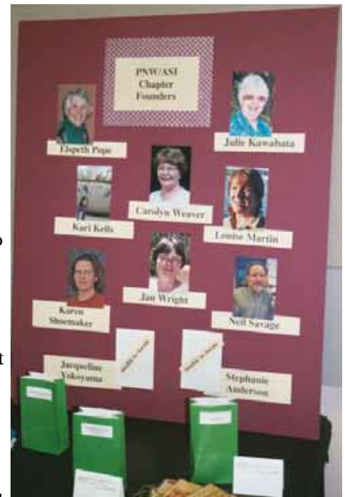
A display at the 10th Anniversary meeting introduced the PNW chapter founding members.