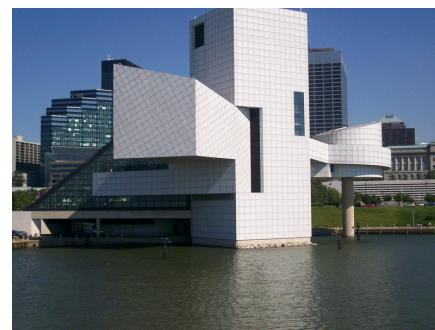
Rock and Roll Hall of Fame

Indexers Rock, the 2018 national conference, gave me a chance to both indulge in a bit of nostalgia about the past and look forward to coming trends in the indexing world. The Rock and Roll Hall of Fame reminded me of musicians from my youth whom I had forgotten about, and while I was in the area, I noticed the positive influence that sports, various ethnic groups, and community efforts make in this lake-side city.